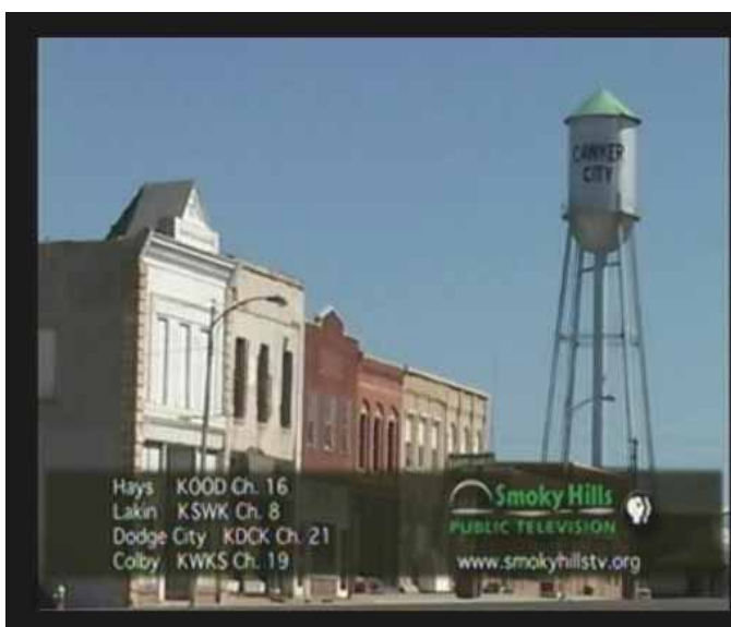
KOOD-16 Hays, KS 536 mi Tr seen 9/24/10 @2329 CT