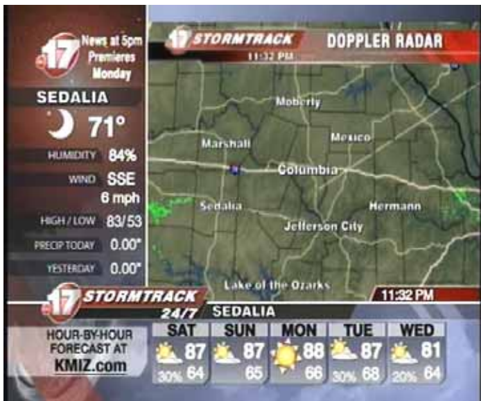
KMIZ-17.3 Columbia, MO 347 mi Tr seen 9/17/10 @2332 CT