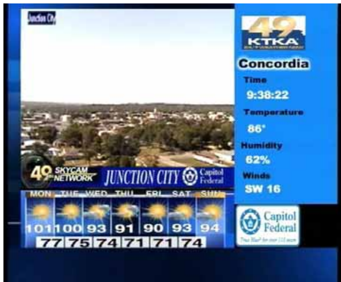
KTKA-49 Topeka, KS 413 mi Tr seen 8/2/10 @0938 CT