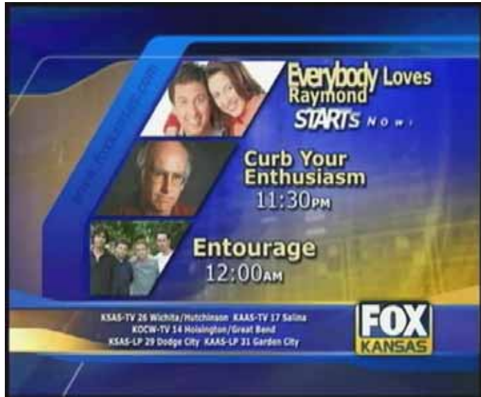
KSAS-26 Wichita, KS 401 mi Tr seen 9/24/10 @2259 CT