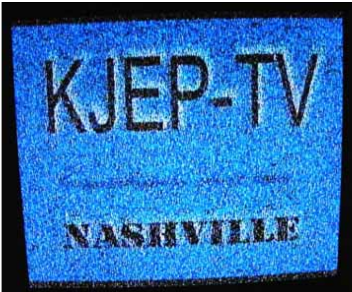
KJEP-CA-23 Nashville, AR 117 mi Tr seen 9/13/10

We start with a couple of recent analog photos...wait...huh? Analog is still on?? Yep! At least in Arkansas it is. From the files of Ripley's Believe it or Not .