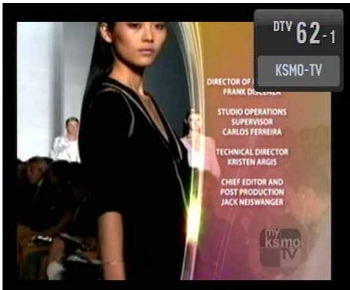
KSMO-47 Kansas City, MO 393 mi Tr seen 8/2/10 @0857 CT