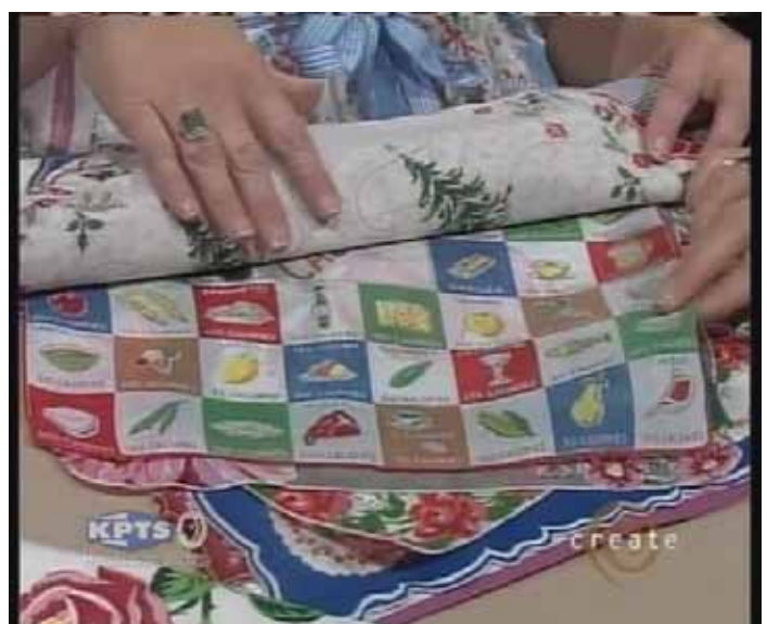
KPTS-8 Hutchinson, KS 447 mi Tr seen 9/24/10 @2302 CT