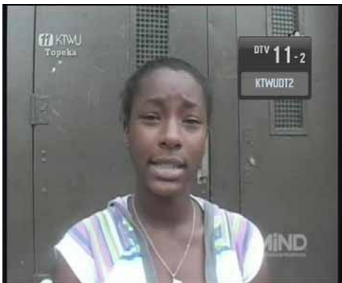
KTWU-11.2 Topeka, KS 413 mi Tr seen 8/2/10 @0936 CT