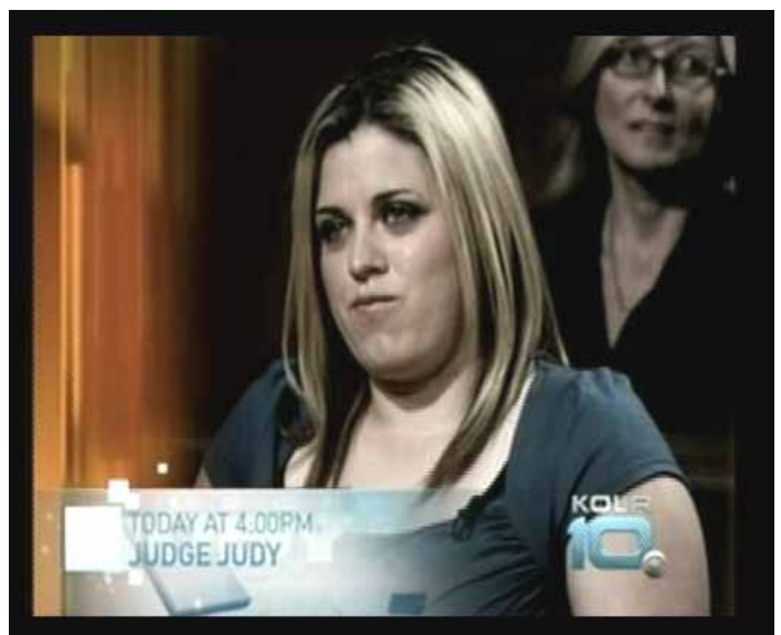
KOLR-10 Springfield, MO 240 mi Tr seen 8/2/10 @0948 CT