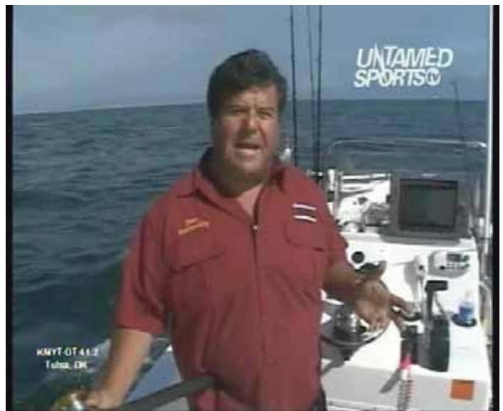
KMYT-41.2 Tulsa, OK 279 mi Tr seen 9/24/10 @2318 CT