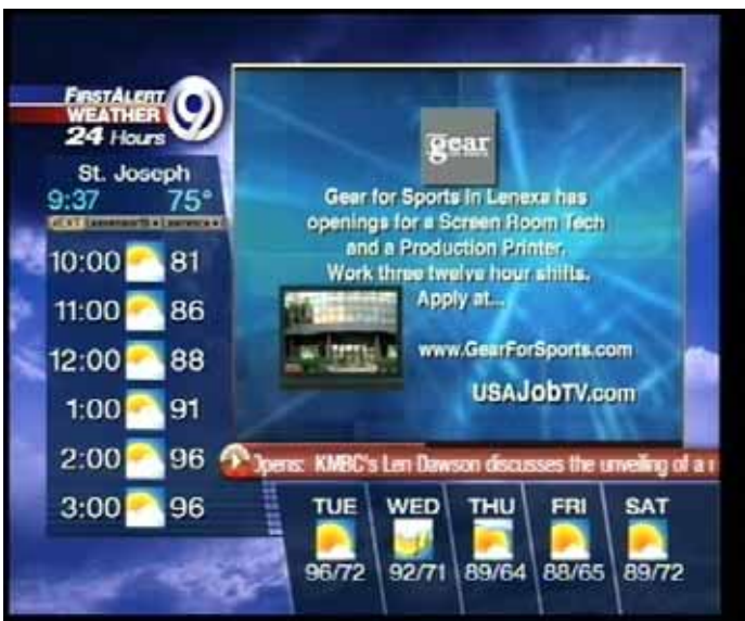
KMBC-29.2 Kansas City, MO 391 mi Tr seen 8/2/10 @0937 CT

And now back to DTV reality, a nice opening to the North. Fritze comments: "I arrived home after a local HS football game and while hearing some signs of tropo on the car radio and feeling a slight change in the air didn't think much of things until the converter box tuned to (and antenna pointed at) WXVT 15 wasn't decoding WXVT at all but at 10:30pm was decoding another channel 15 station--in Fayetteville AR. It was then "off to the races" after a quick check of RF 50 revealing a decode of KNWA Rogers AR."