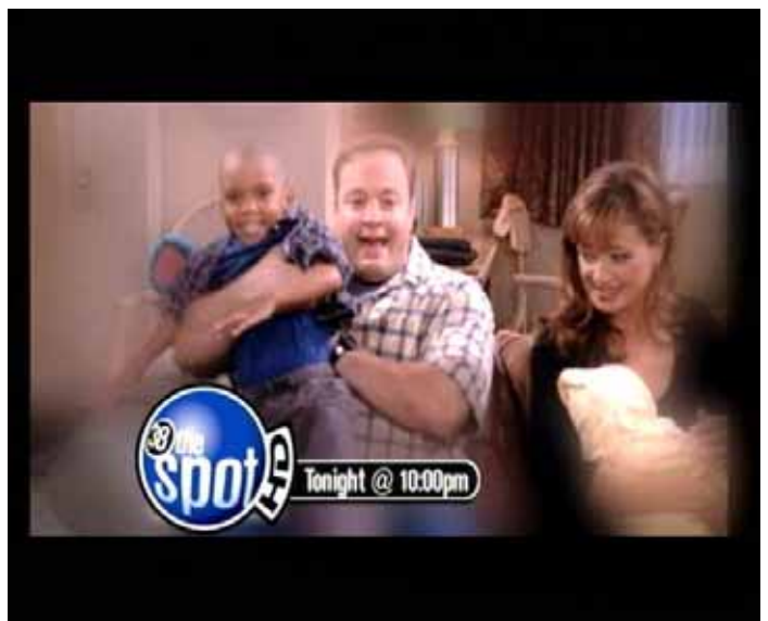
KMCI-41 Lawrence, KS 396 mi Tr seen 8/2/10 @0858 CT