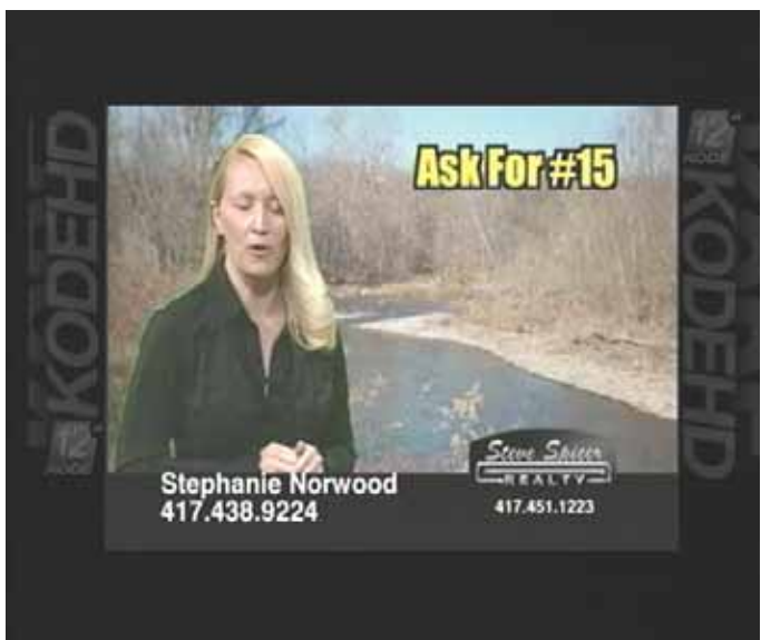
KODE-12.1 Joplin, MO 263 mi Tr seen 9/24/10 @2303 CT