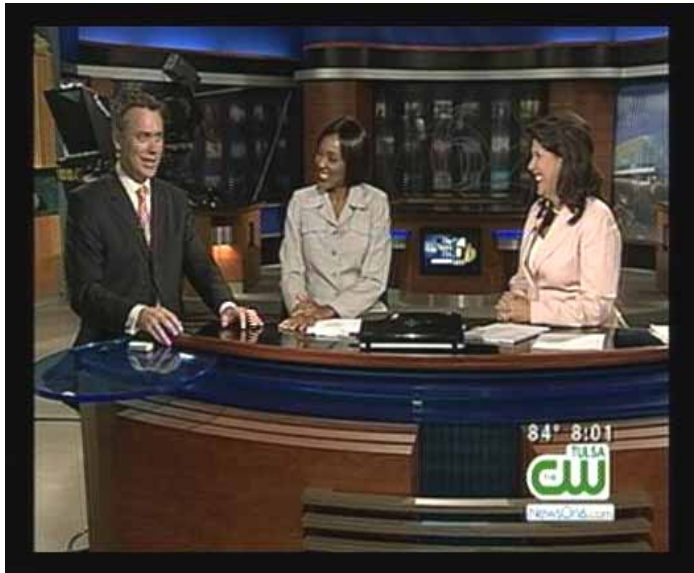
KQCW-20 Muskogee, OK 233 mi Tr seen 8/2/10 @0801 CT