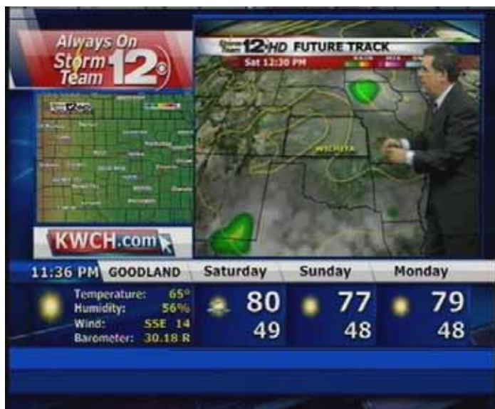
KWCH-19.2 Hutchinson, KS 447 mi Tr seen 9/24/10 @2336 CT